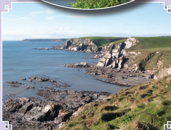
Along Coast Path near Westcombe