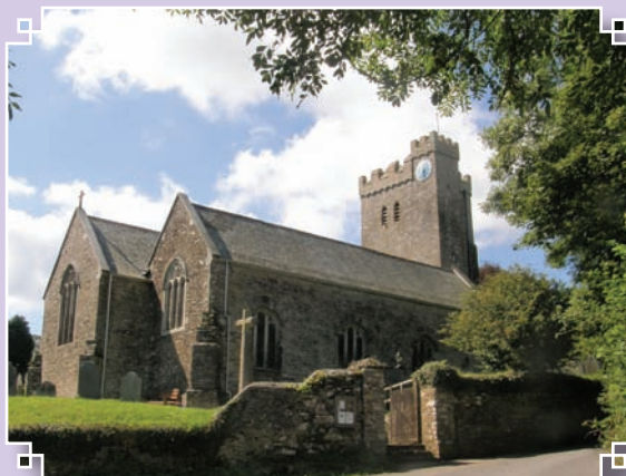
Church of St James the Less